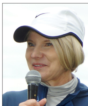
Mayor Booth District of West Vancouver